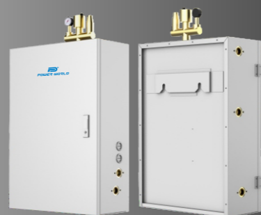
Safer and Durable

Power World's Hydrobox makes heat pump installation and maintenance easier. Hydrobox integrates water pumps, small expansion tank, valves, safety components, electric heater, and other components. When installing the heat pump system, the installer can connect the heat pump directly to the Hydrobox, which is very simple and convenient, even if you do not have a lot of experience, you can follow the instructions to complete the installation.